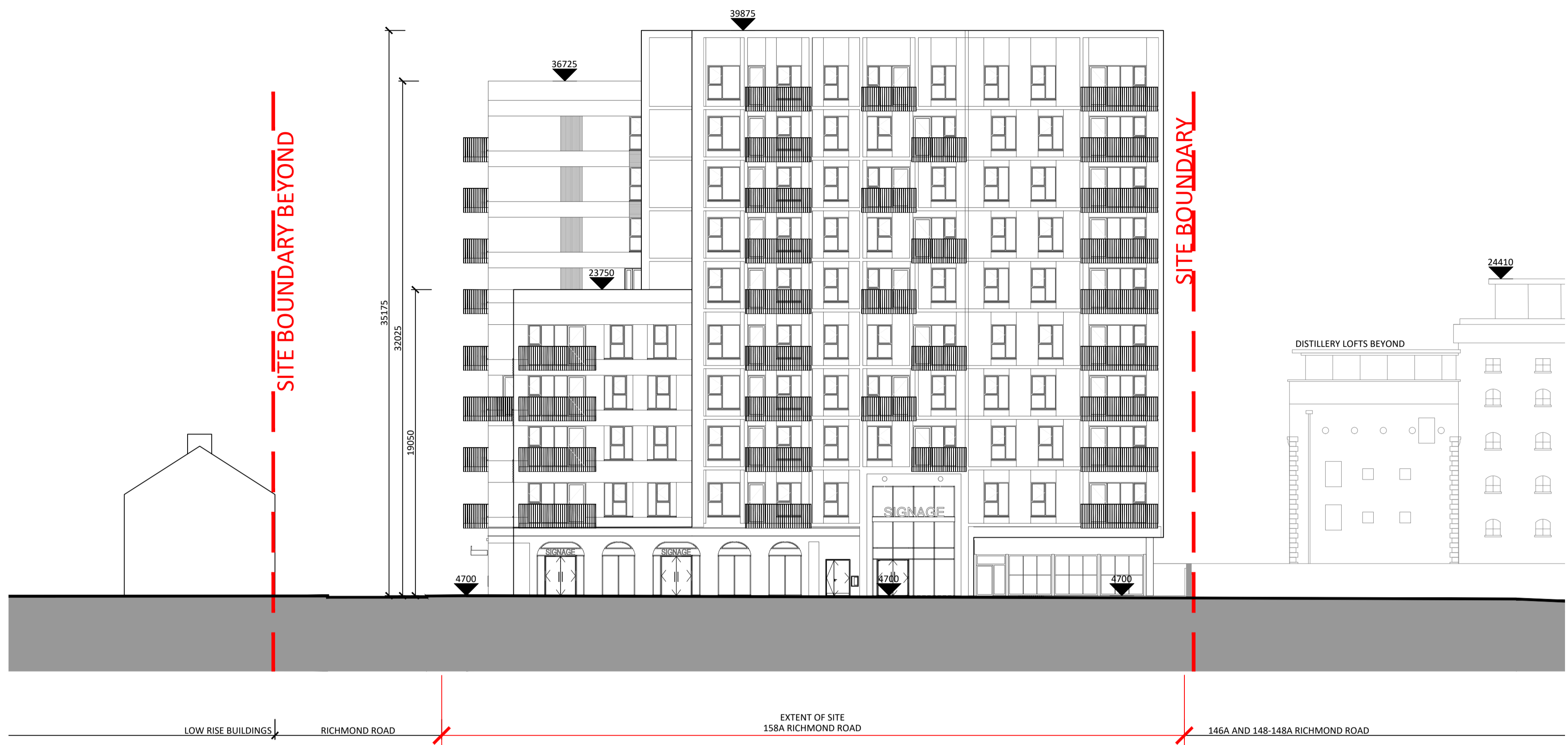
1 1305A_Proposed Contextual North West Elevation_B-B - SCENARIO A 1 : 200

LEGEND — SITE APPLICATION AREA — SITE DEVELOPMENT AREA = 0.55 ha