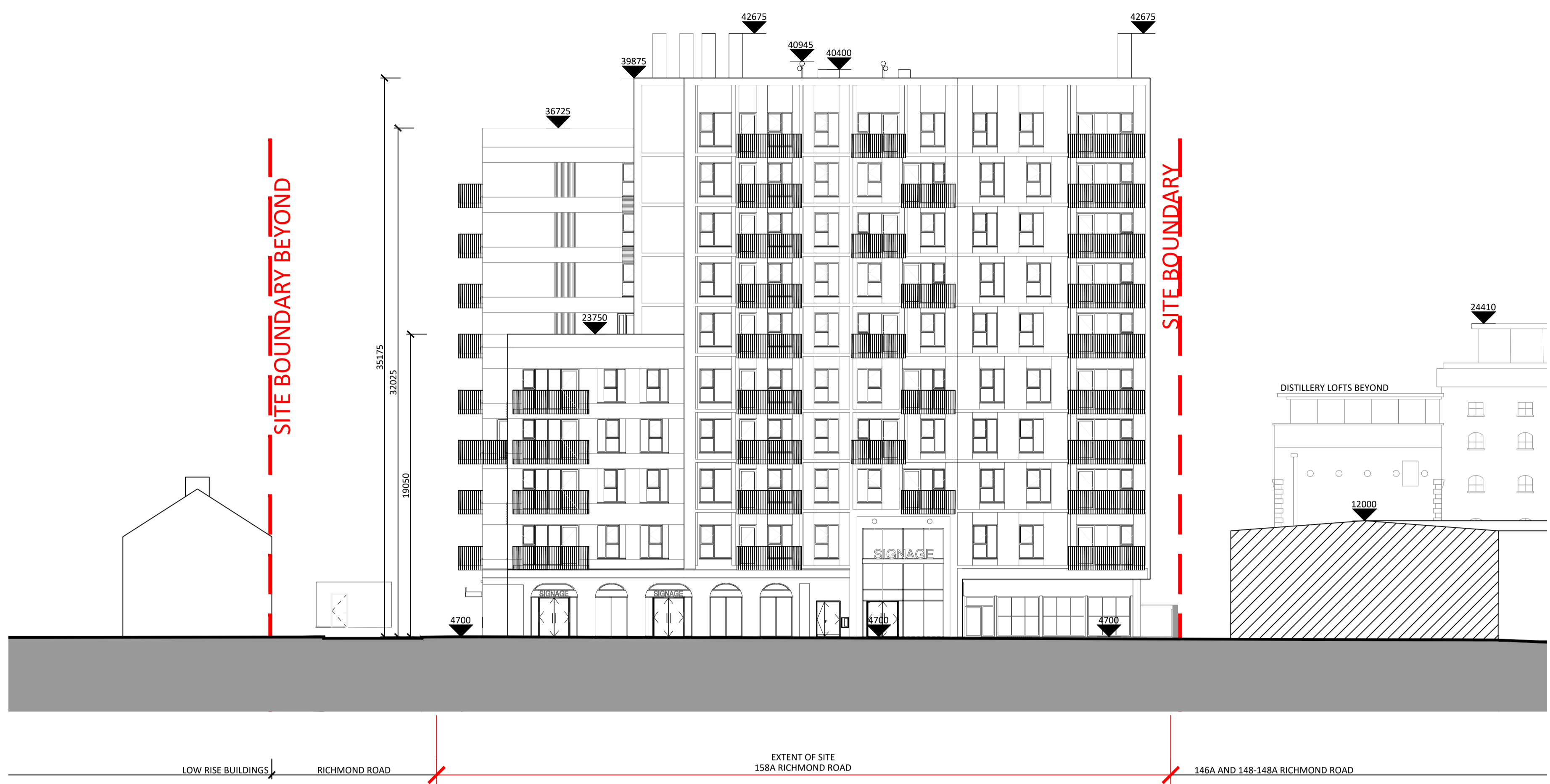
1 1305B_Proposed Contextual North West Elevation_B-B - SCENARIO B 1 : 200

LEGEND — SITE APPLICATION AREA — SITE DEVELOPMENT AREA = 0.55 ha