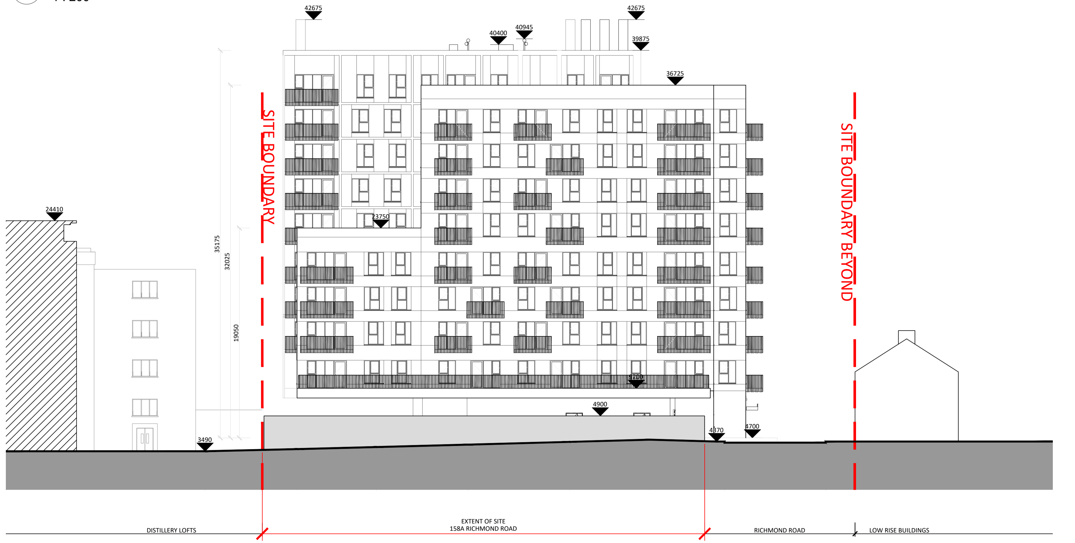
2 1305B_Proposed Contextual South East Elevation_C-C - SCENARIO B 1 : 200